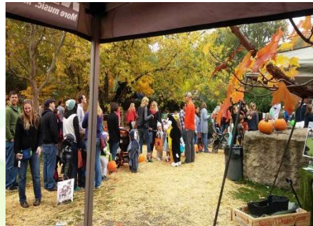
Zoo Boise Egg-Stravaganza & Boo at the Zoo