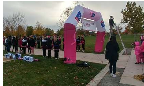
American Cancer Society Making Strides