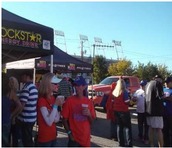
Bronco Game Day